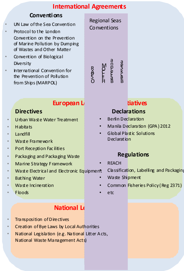
Figure 2. An example of the hierarchy of legislation concerning waste management of relevance to the reduction of litter entering the marine environment.

When considering the relative value of national, regional/European or international legislation it is instructive to consider the time taken to complete the process, from inception of a concept to the ratification and implementation of the legal instrument. For example, while it may be possible to introduce national legislation in a matter of months, it may take many years or decades for the international community to reach agreement on the purpose, extent, verification and implementation of a Convention. In matters of enforcement it is usually the responsibility of national authorities to police and bring to court those individuals or organizations deemed to have broken the law. Unfortunately, the existence of a legal instrument does not guarantee that illegal practices will cease. Sovereign states have a